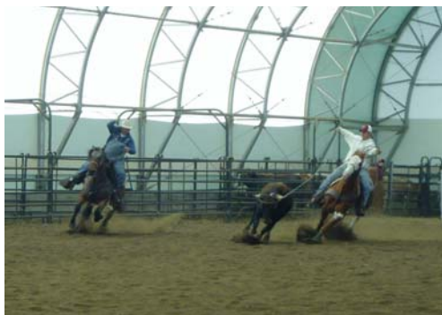
Two ropers practicing on a Wednesday night

March 16, 2006 at the University of Kentucky is the only show scheduled for the team this semester. IDA dressage shows are one day events.