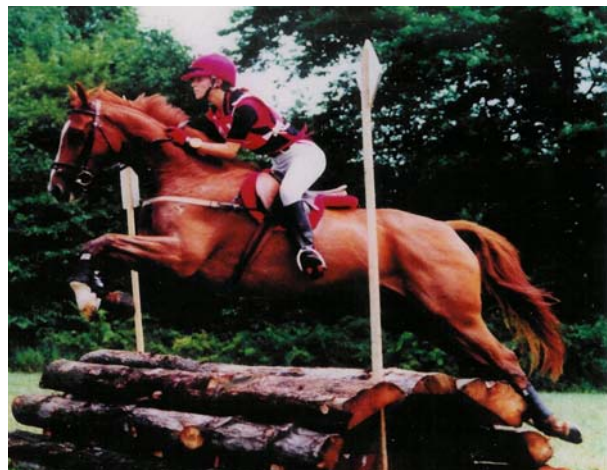
Recent Peace Point donation Airbourne Charlie (thoroughbred) "Charlie"